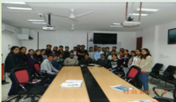
Participants of the Training Session